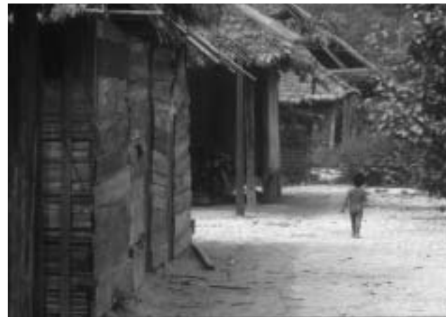
FIGURE 6. (RIGHT) Ese Eja community, Heath river (Peru).