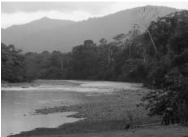
FIGURE 5. (LEFT) Heath river.

ty mentioned earlier. Native communities too, like the notion of "tribe," are politico-historical artifacts; specifically, they are the products of contact with the state and broad political, legal and economic systems. 9 As such, and in terms of their location, physical makeup, and internal organization, Ese Eja communities reflect a history of increasingly intense — yet consistently ambivalent — relations with the state and market, including related processes of migration, dislocation, fragmentation, sedentization, dependency on outside goods and services, and increased internal differentiation.