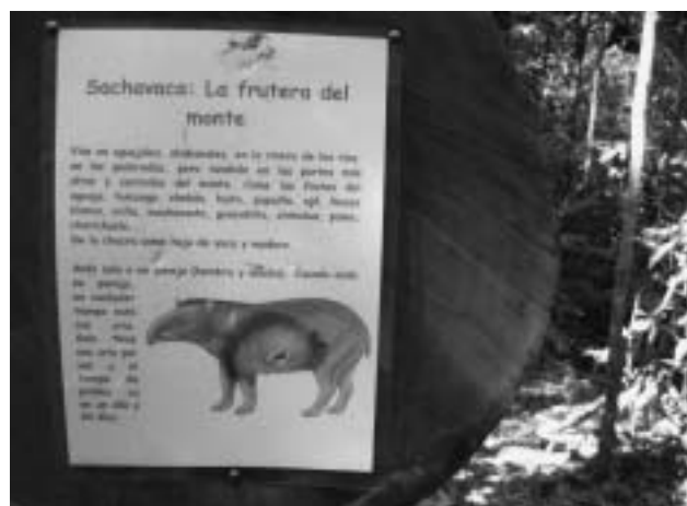
FIGURE 10. Community environmental education poster, Heath river.