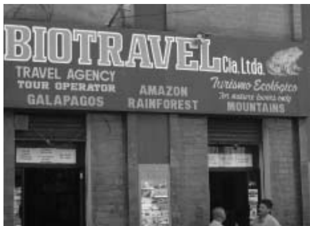
FIGURE 7. Tourism agency, Rurrenabaque (Bolivia).

As in other areas, ecotourism among the Ese Eja is closely linked to and dependent on the creation and management of natural protected areas, in this case the Tambopata National Reserve and the Bahuaja-Sonene National Park, itself part of an international program seeking to establish a corridor of protected areas on the eastern flanks of the Andes. 14 As with other “indigenous” ecotourism ventures in western Amazonia, lodges seek to promote distinct ecological and social attractions in order to lure visitors and compete with neighboring operations (FIG. 9). A global biodiversity “hotspot,” the area is widely known for its “pristine” and accessible environments (forests, lakes, and bird and mammal clay licks — areas where large number of animals congregate to feed), and for its extraordinary diversity of flora and fauna. 15 The lodges also allow visitors to experience such “social experiences” as visits to the community or to certain community projects, walks with