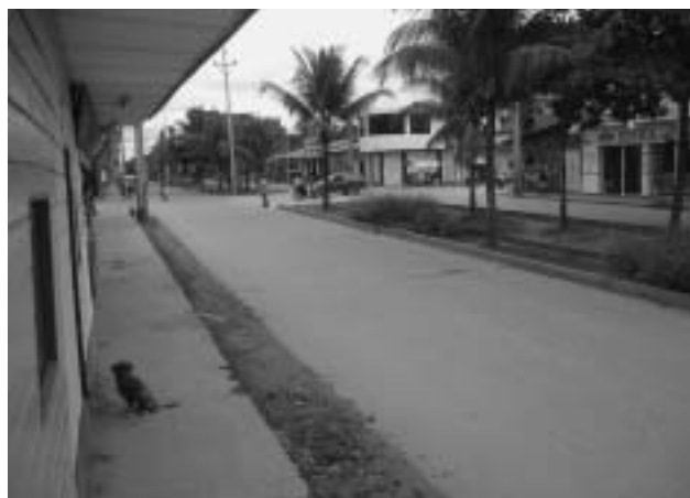
FIGURE 3. Puerto Maldonado (Peru).

urbanization. Urbanized indigenous peoples have similarly been neglected by indigenous organizations and by other organizations working with rural indigenous communities.