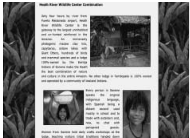
FIGURE 9. Website with information on the Ese Eja lodge ( http://www.greentracks.com/Tambopata_programs.htm ).