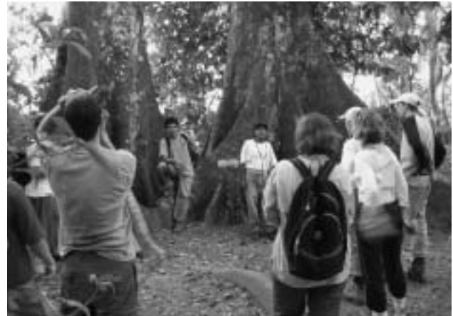
FIGURE 8. Ese Eja guides and tourists, Tambopata river (Peru).

Ecotourism has been heralded by its defenders as an effective way of providing economic incentives for the conservation of forests. 11 A subset of such ventures directly involves local dwellers, either by including them in some of the activities promoted by an ecotourism lodge, hiring them as employees, or, in some cases, establishing formal partnerships and working agreements (FIG. 7). Two of the Ese Eja communities in Peru have developed formal partnerships with national tourist operators, in both cases with direct support of international environmental organizations and donors. 12 Despite differences in the details of how the partnerships have been set up, both Ese Eja lodges are built within the titled lands of the communities; both seek to directly involve the Ese Eja in staffing, and to a lesser extent, running the lodges; and both are either partly or fully owned by the community in question. 13 In one of the lodges, community members have been actively trained as guides, and have been sent to Lima, the capital of Peru to study English or specialist managerial skills (FIG. 8).