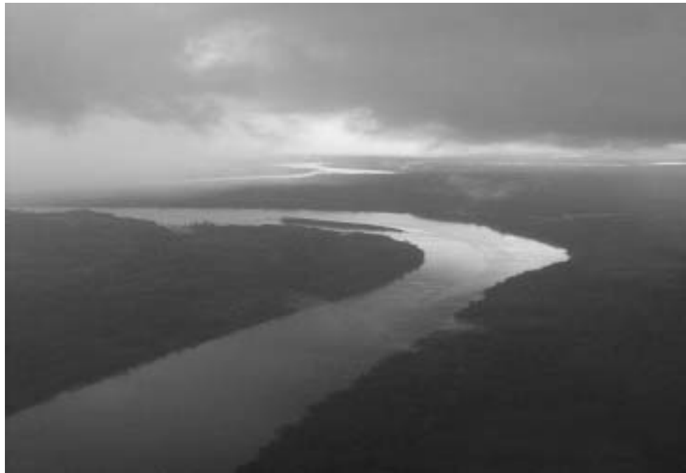
FIGURE 2. (BELOW) Heath river.