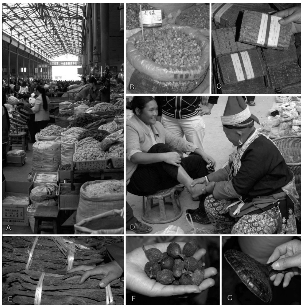
Figure 3.2 China: The world's biggest medicinal trade

a) Massive demand for herbal medicines in China is apparent in the bustling marketplaces like Hehuachi market, in Chengdu, China, which has an annual trade turnover of 1.2 billion yuan (around US$148 million) in more than 200,000 tonnes of traditional medicine per year. b) Market values have encouraged cultivation of 25 to 30 per cent of Chinese medicinal species, including Ginkgo biloba (for seeds and leaves). c) Over-harvesting of wild populations of forest species, such as Eucommia ulmoides , a monotypic species, has forced a shift to plantation production. d) For women in ethnic minorities, such as Yao people, providing herbal-based health care is an important cross-cultural niche for their skills. e) Some species cannot be cultivated, however, such as this parasitic species, Cynomorium songaricum (Cynomoriaceae), from Xinjiang, China. f) To enhance production of Ammorium tsao-ko , forest trees are felled to keep the canopy open, affecting montane forests of northern Vietnam and southwestern China. g) Medicinal fungi, often from forests, are also highly valued, such as Ganoderma (chizi), which are traded internationally.